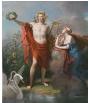
upper and lower left: Apollo, God of Light, Eloquence, Poetry and Fine Arts with Urania, Muse of Astronomy , 1798

The cleaned paintings were retouched and the damaged areas were inpainted. The materials used for reconstruction, including the final protective varnish layer, are all reversible and can be removed in the future without harming the original paint surface. In addition, the original frames were restored.