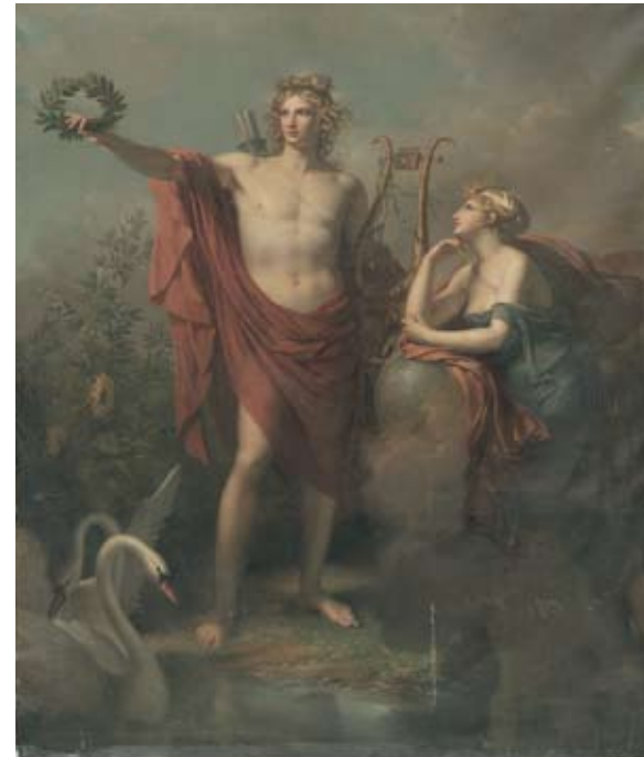
All images front and back: Charles Meynier (French, 1768–1832). Oil on canvas. Severance and Greta Millikin Purchase Fund 2003.6.1–5