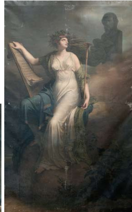
above and right: Calliope, Muse of Epic Poetry , 1800