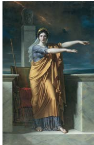
below left and right: Polyhymnia, Muse of Eloquence , 1800