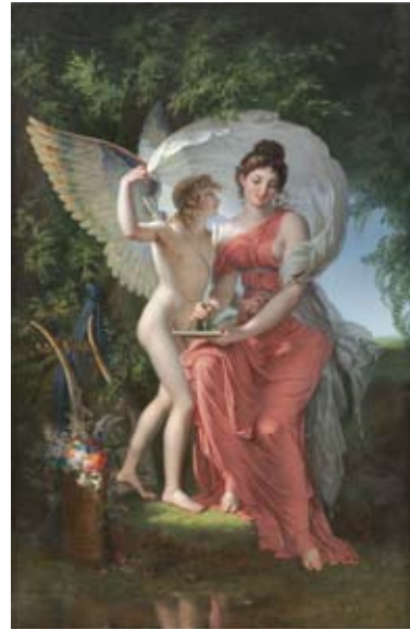
far and near left: Erato, Muse of Lyrical Poetry , 1802