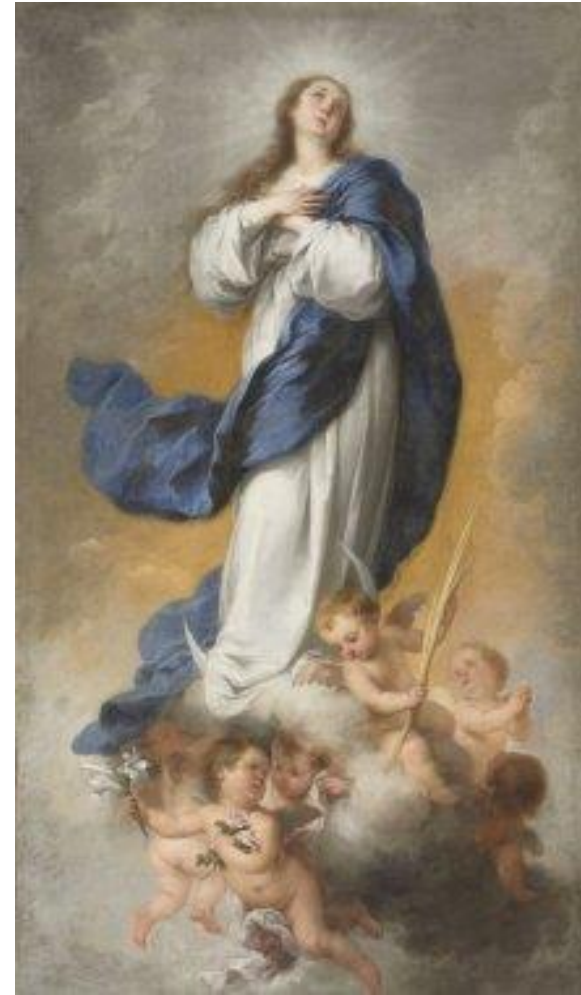
The Immaculate Conception , c. 1680 Bartolomé Esteban Murillo (Spanish, 1617 - 1682) Oil on canvas 1959.189