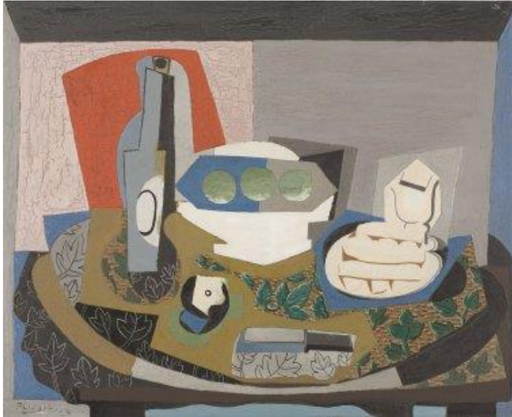
Still Life with Biscuits , 1924 Pablo Picasso (Spanish, 1881 - 1973) Oil, sand, other materials on canvas 1978.45