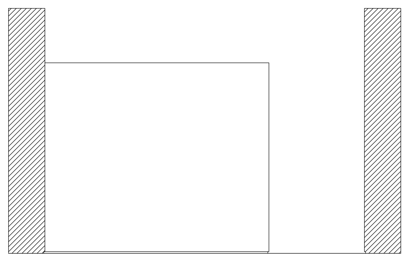
Division Between Sculpture and drawing galleries without header - creates a more open environment